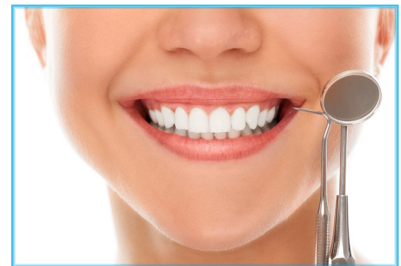
One Day Dentistry