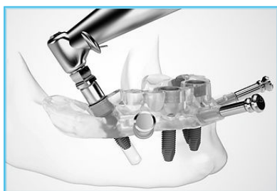
Centre for CAD CAM Dentistry