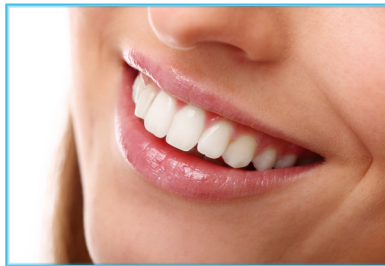
Full mouth Rehabilitation Centre