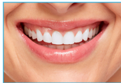
Correction of Teeth & Smile Designing with Invisible Braces