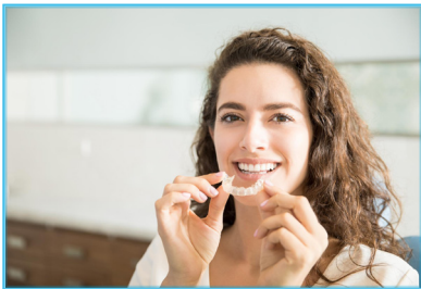
Official Invisalign Provider