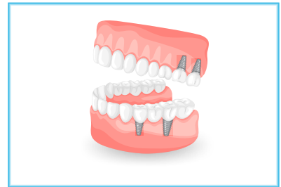
Dental Implant Rehabilitation