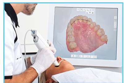
Intra Oral Scanner